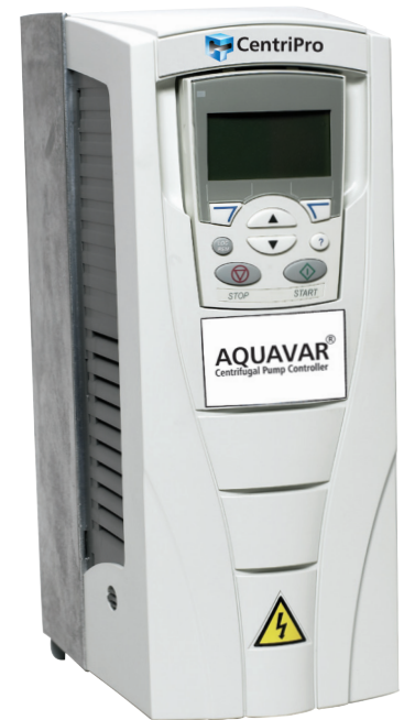
Wall Mounted Version