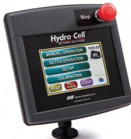
Start-up menu options.