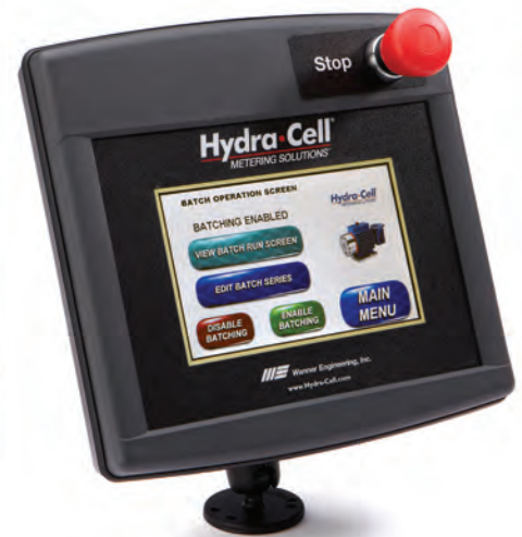
Sample menu for batch operation.