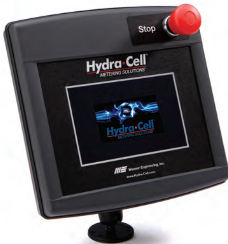
Opening screen - touch to activate.