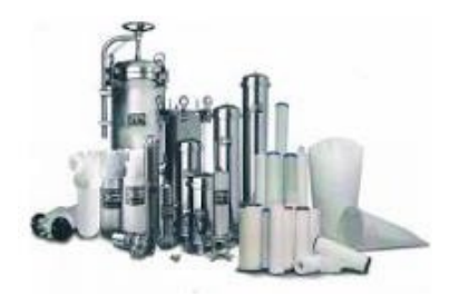
Filters and Vessels/Capsules