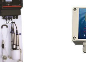
Controllers and Sensors