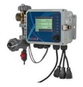
Controllers and Sensors